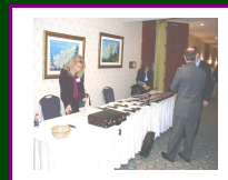
Illustration / previous forums